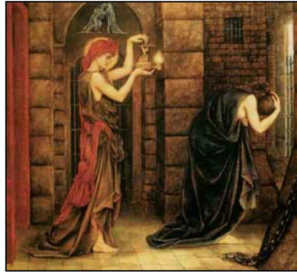
Crouching Woman , 1880-1882, Auguste Rodin, 1840-1917 Hope in the Prison of Despair , 1887, Evelyn de Morgan, 1850-1919

Crouching Woman has been freed from stone for eternity by Rodin's artistry.